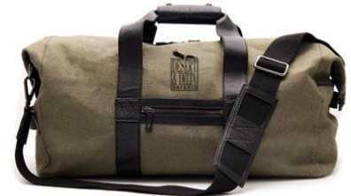
SOFT SIDED BAGS ONLY