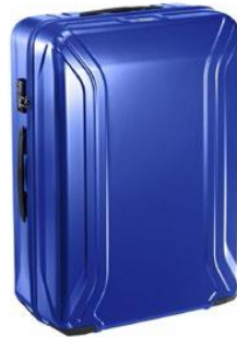
NO HARD BODY CASES