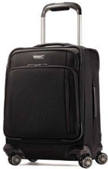
NO WHEELED OR PULL HANDCASES